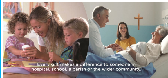
Every gift makes a difference to someone in hospital, school, a parish or the wider community.